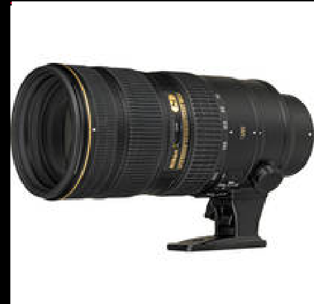
70-200mm f/2.8 $2400