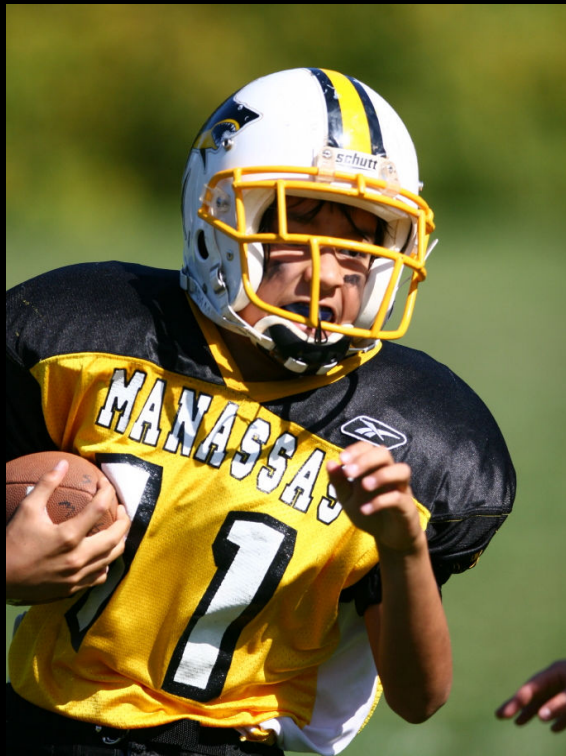
300mm with Monopod