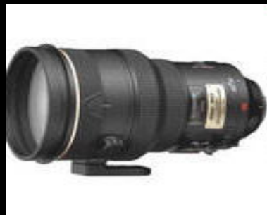
200mm f/2.0 $4900