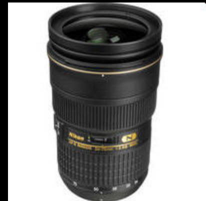
24-70mm f/2.8 $1900