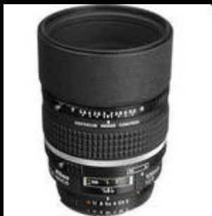
105mm f/2.0 $1100