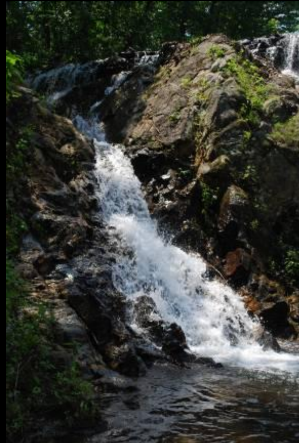
Fast shutter speed 1/250^{\text{th}} @ f/8.0