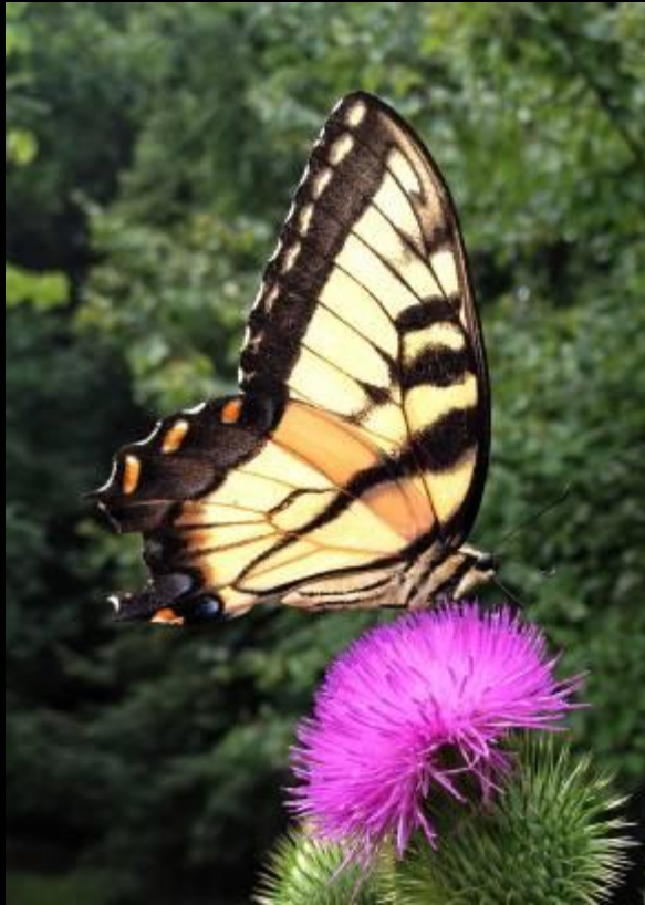
Open aperture 1/280^{\text{th}} @ f/2.4