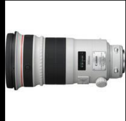
300mm f/2.8 $7300