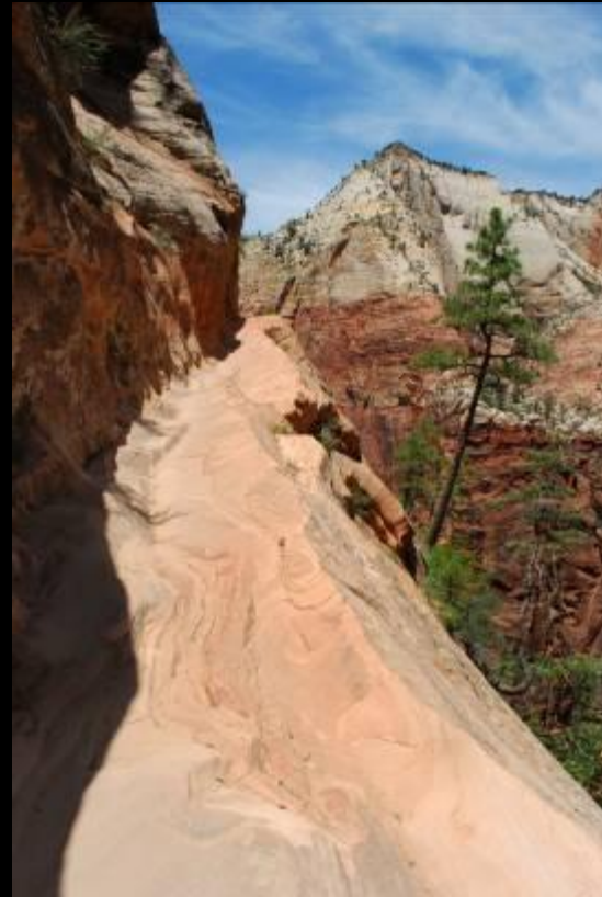
Closed aperture 1/200^{\text{th}} @ f/16