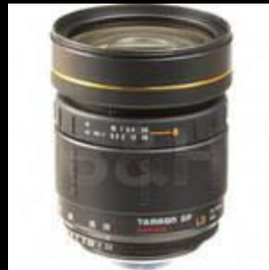
28-105mm f/2.8 $600