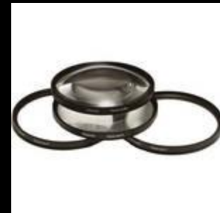
Close-up filter kit $35