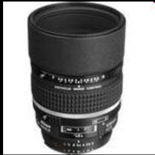
105mm f/2.0 $1100