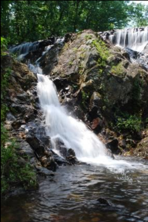
Slow shutter speed 1/10^{\text{th}} @ f/29