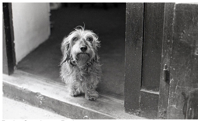
Rodin Museum guard, Paris; Concierge, Paris