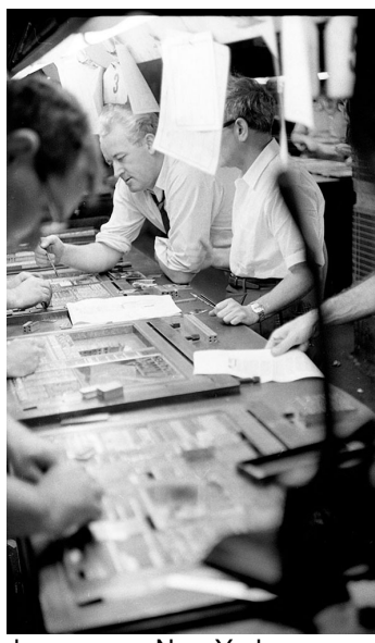
McSorley's Ale House, NY; Old woman on steps, Paris; New York Post make-up copy, New York