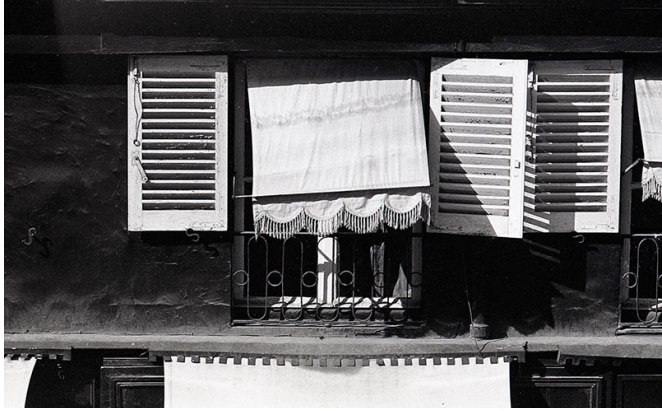
Alone in Paris; Morning Window, Paris