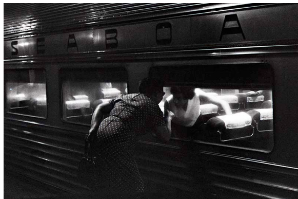
Rainy subway yard, Bronx, NY; Penn Station farewell, NY