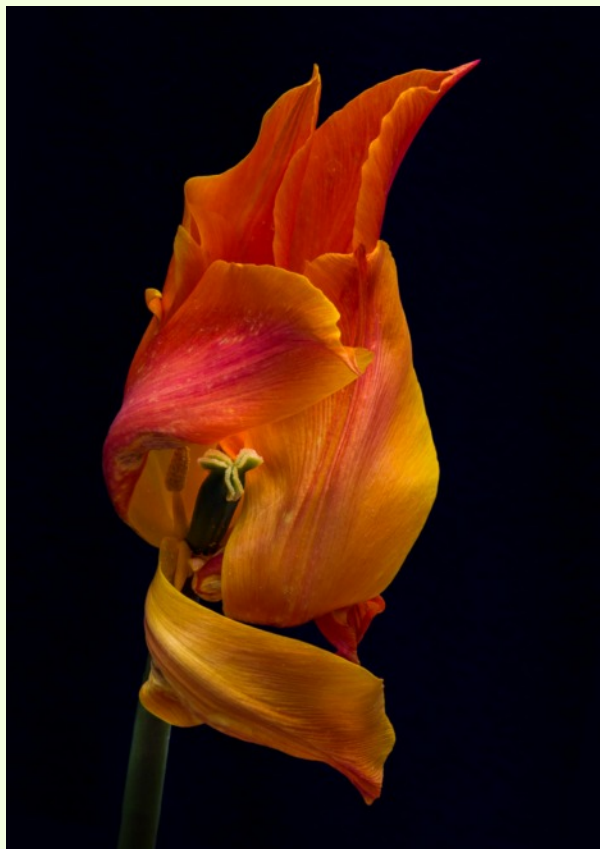
Doug Wolter, "Wind Wrapped"

Coco planted many wonderful tulip bulbs in November. This photo is of one of the resulting tulips - shot on a May day at 1:00 PM with two reflectors, one blocking the sun, the other reflecting some light back onto the flower, with a Tamron 180mm macro lens mounted on a Canon 5D Mark III, ISO 400, 1/10s at f/32.