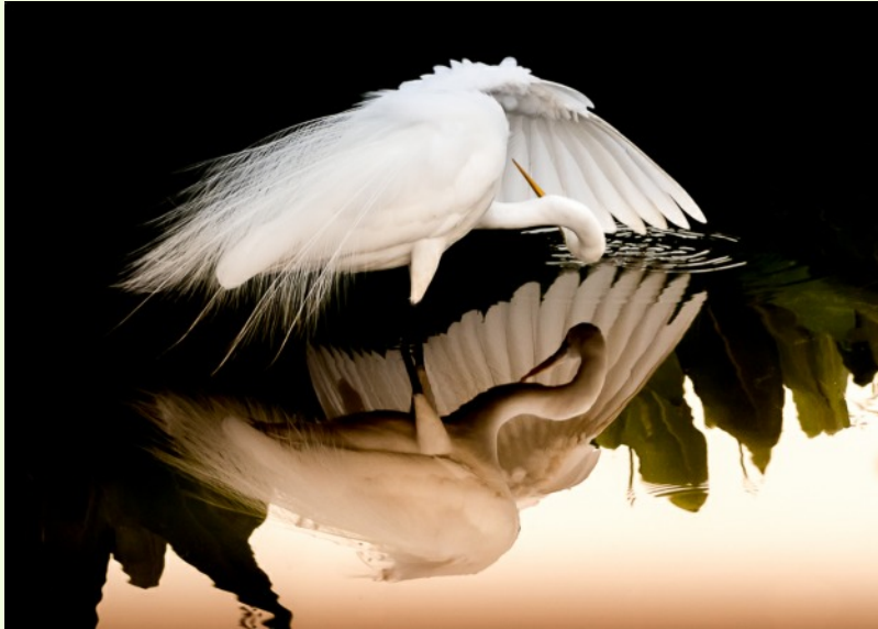
Larry Gold, "Illuminating Reflection"