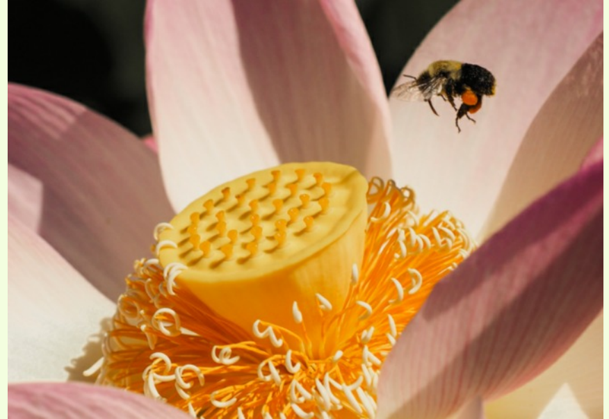
Larry Gold, "Attack!!"

The spider in its web was taken at Brookside Gardens along the the walking path. There were several of these beautifully crafted webs in one area. But, not all the spiders would let me get close enough without running away. Taken with a Panasonic GX7 camera with a 90mm (equivalent) macro lens on a tripod. Exposure was 1/40s, f/5.0 at ISO 800.