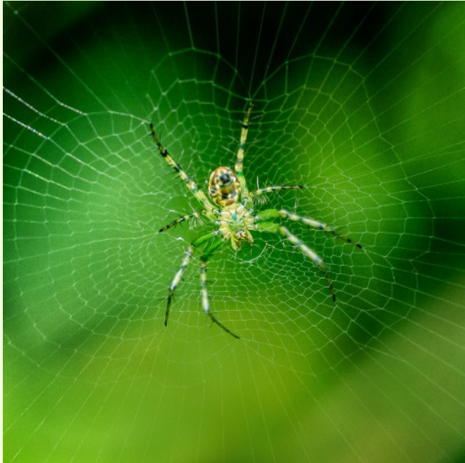
David Terao, "Spider in Web"

The spider in its web was taken at Brookside Gardens along the the walking path. There were several of these beautifully crafted webs in one area. But, not all the spiders would let me get close enough without running away. Taken with a Panasonic GX7 camera with a 90mm (equivalent) macro lens on a tripod. Exposure was 1/40s, f/5.0 at ISO 800.