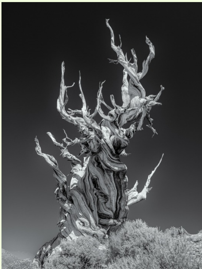
David Terao, "Ancient Bristlecone Pine"

This specimen was shot at the Ancient Bristlecone Pine Forest in the White Mountains of eastern California. It is estimated to be 3000-4000 years old. Although it is dead, the wood does not decay due to the cold, dry environment at 10,000 ft above sea level. Shot with a Panasonic GX7 camera with a 12-35 zoom lens (set at 24mm equivalent) and polarizer. Converted to B&W in Color Efex Pro. The exposure was 1/200s, f/6.3 at ISO 200.