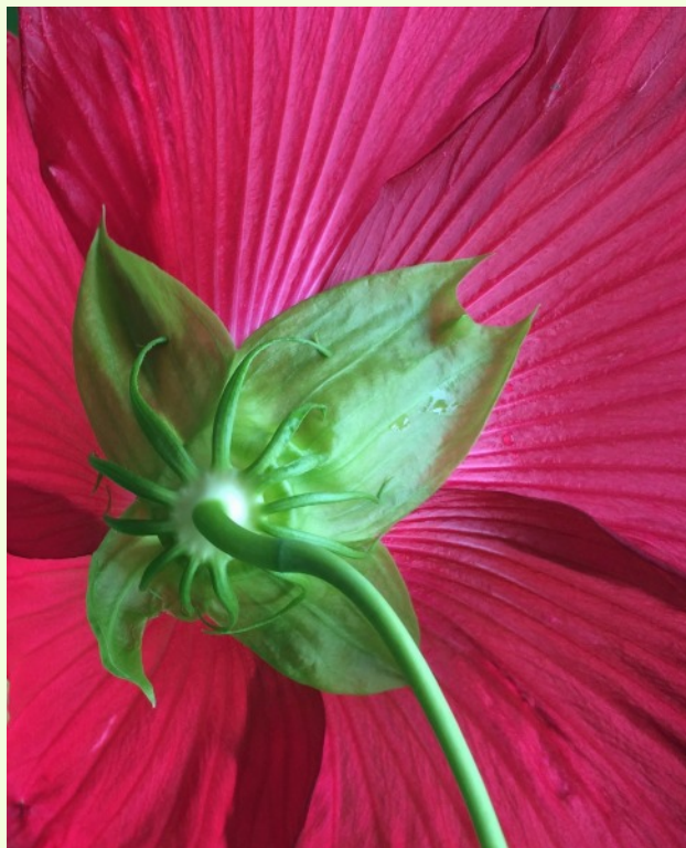
Barbara Karpas, "Hindsight"

Coco planted many wonderful tulip bulbs in November. This photo is of one of the resulting tulips - shot on a May day at 1:00 PM with two reflectors, one blocking the sun, the other reflecting some light back onto the flower, with a Tamron 180mm macro lens mounted on a Canon 5D Mark III, ISO 400, 1/10s at f/32.