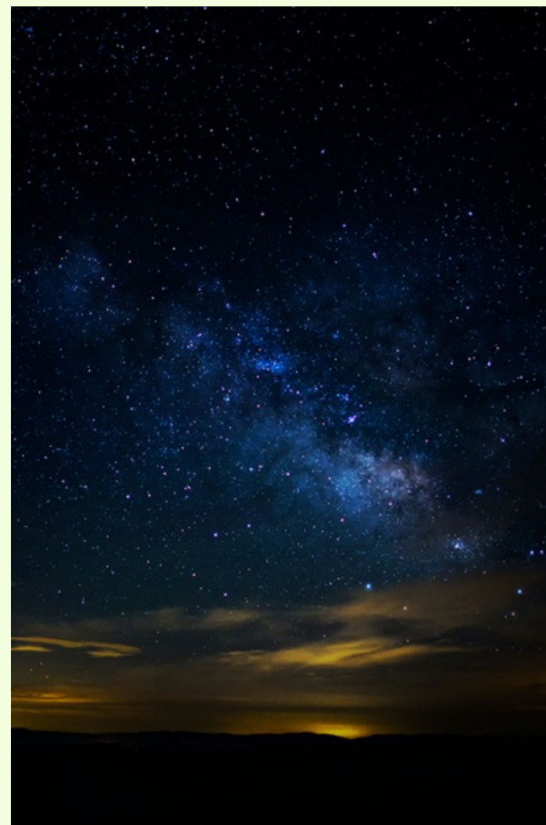
Michael Koren, "Milky Way in Sagittarius"

This specimen was shot at the Ancient Bristlecone Pine Forest in the White Mountains of eastern California. It is estimated to be 3000-4000 years old. Although it is dead, the wood does not decay due to the cold, dry environment at 10,000 ft above sea level. Shot with a Panasonic GX7 camera with a 12-35 zoom lens (set at 24mm equivalent) and polarizer. Converted to B&W in Color Efex Pro. The exposure was 1/200s, f/6.3 at ISO 200.