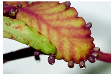
One more November Field Trip

We are looking for images of funny signs or humorous events. Images may be submitted over the upcoming months. During the April workshop, members will have a chance to select the winners. Ribbons will be awarded.