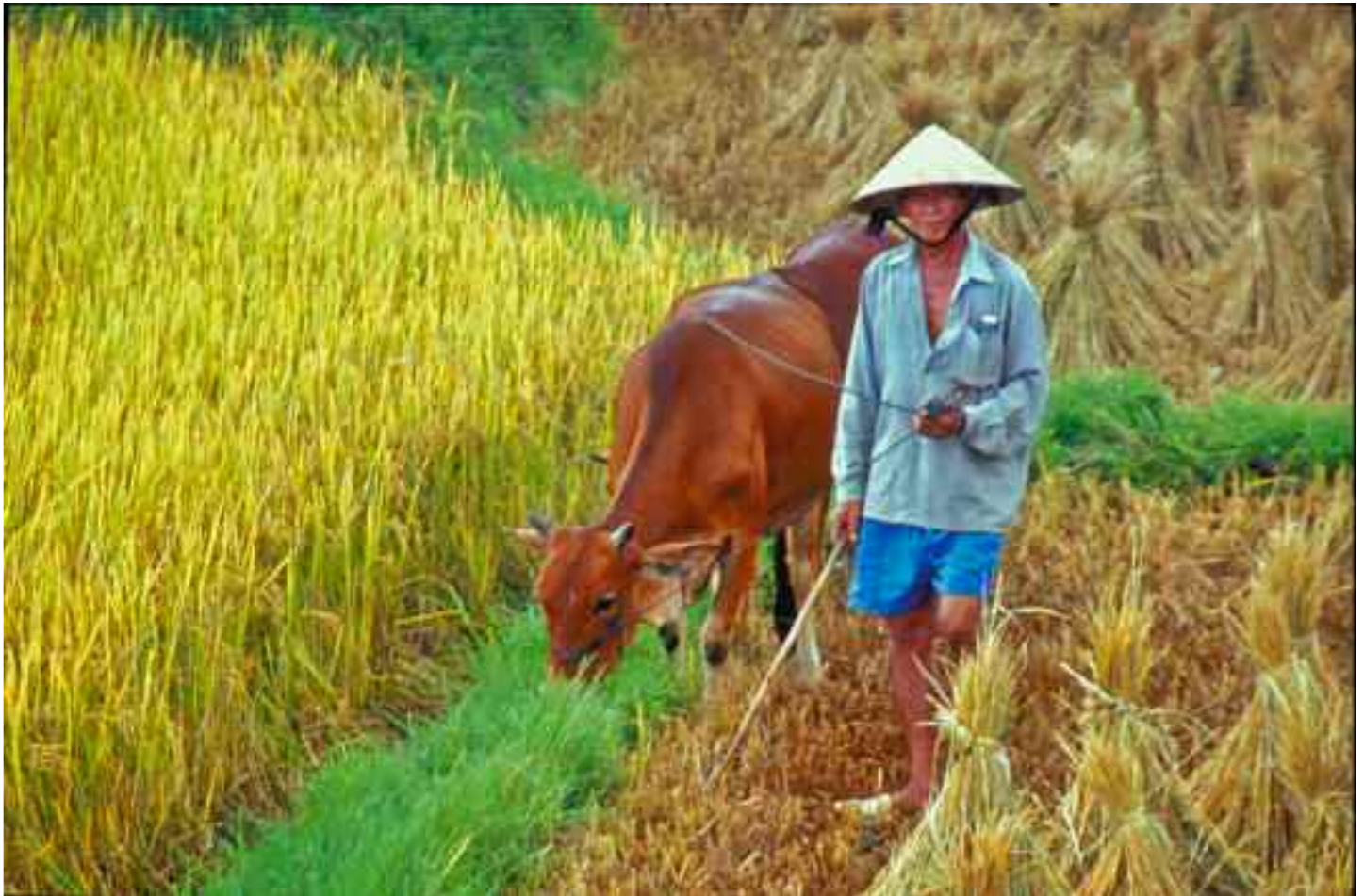
Harvest Time by Michael Tran

S e p t e m b e r 2 0 0 7 • V o l u m e 4 9 • N u m b e r 1