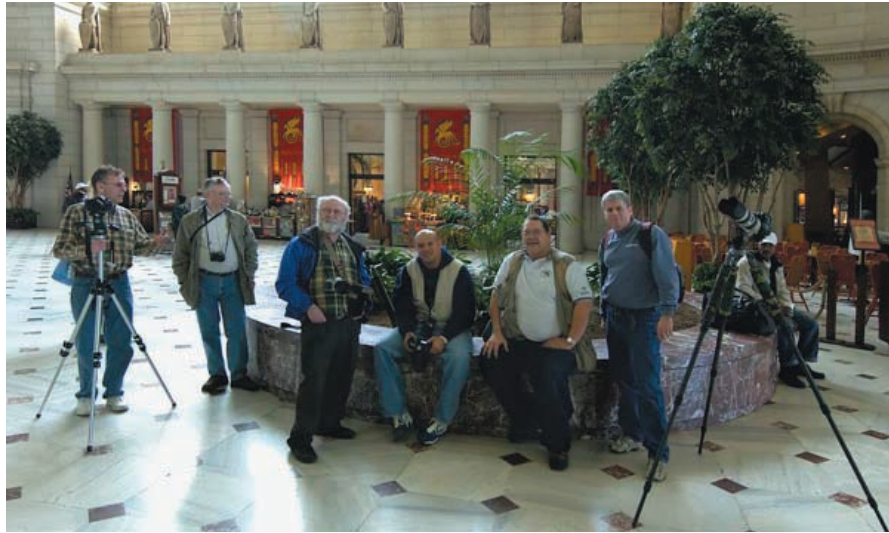
Images from SSCC's recent field trip to Union Station (left and right)

Present jewels (photos and tips) from field trips at meetings.