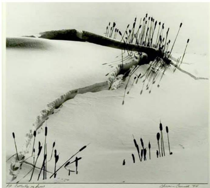
Classic images of winter -- clockwise from top left: Chuck Bress; Max Strange; Chuck Bress; Clarence Carvell; and Max Strange.