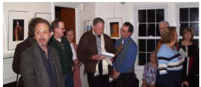
McCrillis Reception, Nov '01

McCrillis is a great place to visit in April. The flowers are blooming and everything is fresh and green. The theme will be "Landscapes of the World". Each member may submit up to five mounted/unframed images for consideration. See the schedule elsewhere in this issue.