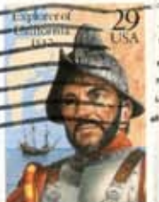
Juan Rodriguez CABRILLO