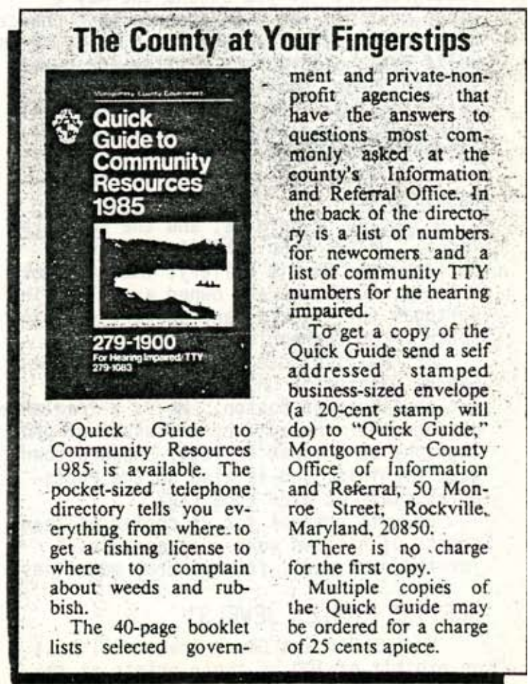
Cover Photo - "Sunday at Lake Needwood" by Arthur K. Yellin