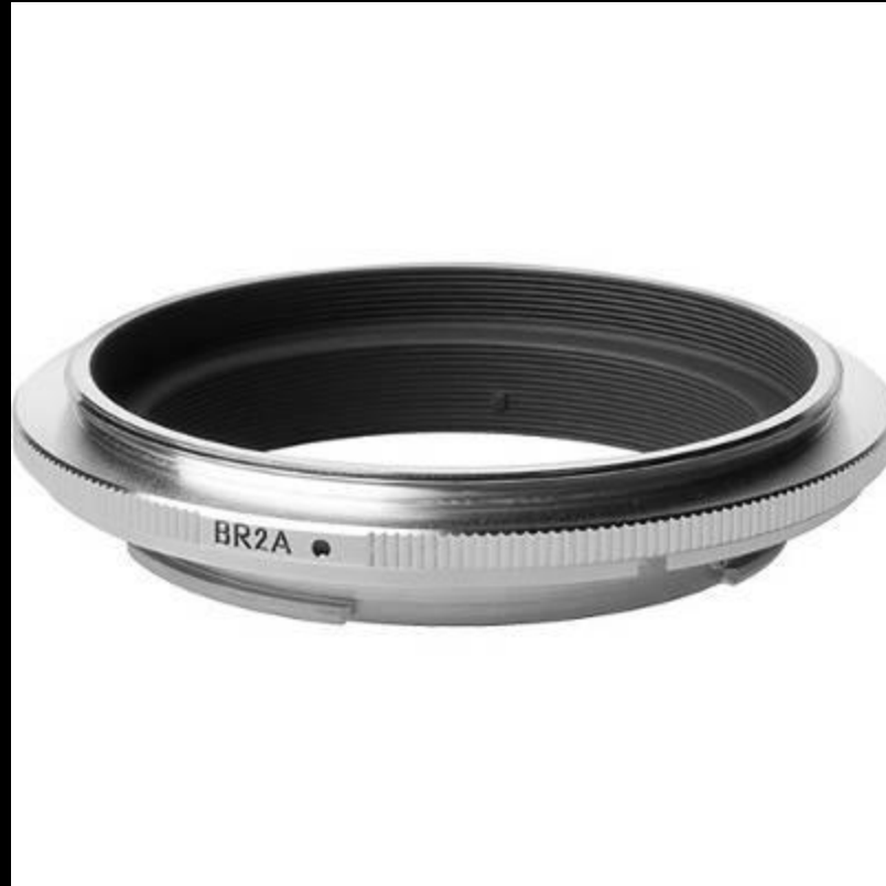
Nikon BR-2A Reversing Ring About $40