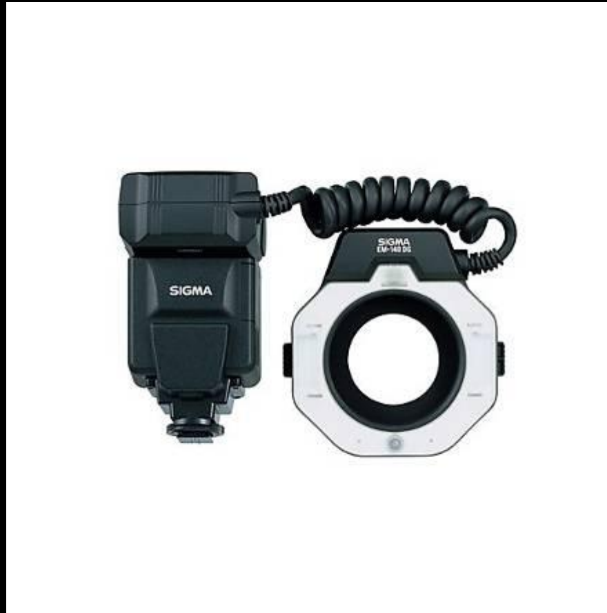
Sigma TTL Ring Flash About $350