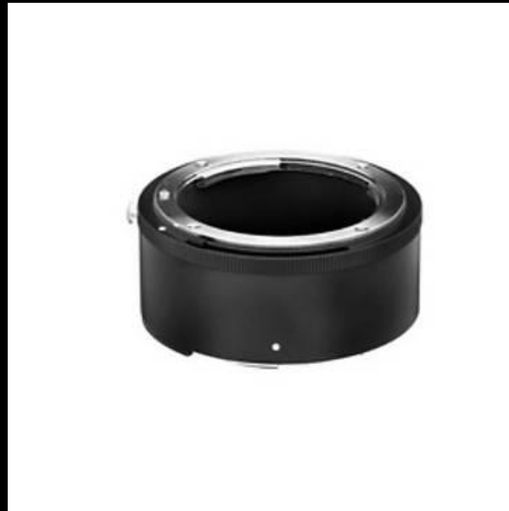
Nikon PK-13A Auto Extension Ring About $99