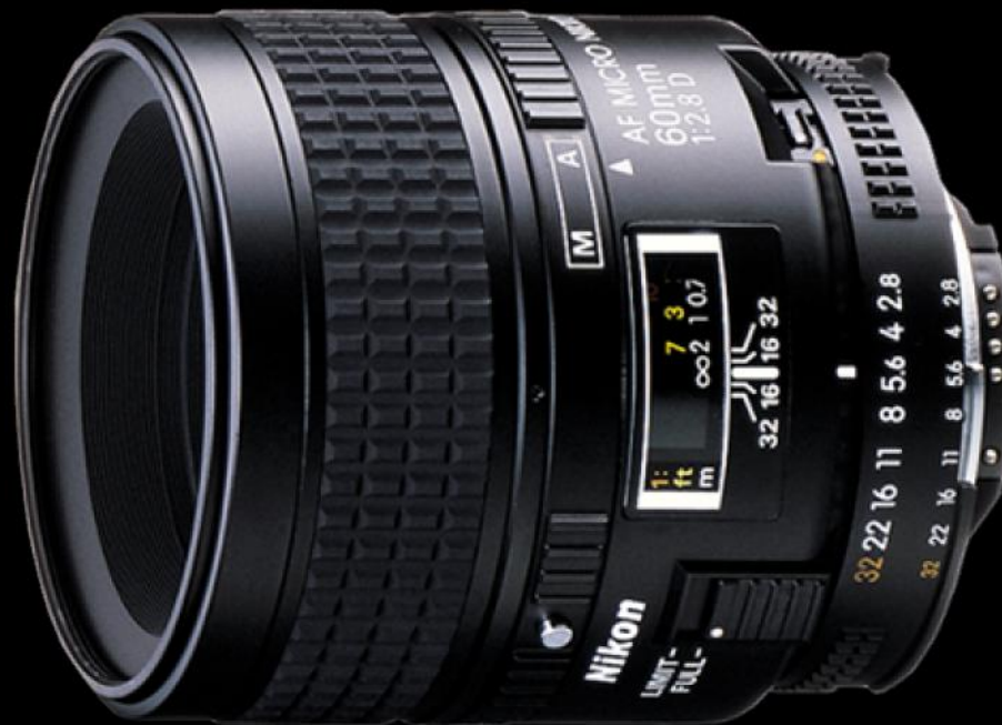
Nikon 60mm f/2.8 About $500